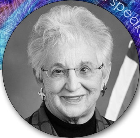
REP. VIRGINIA FOXX (R-NC) U.S. House of Representatives