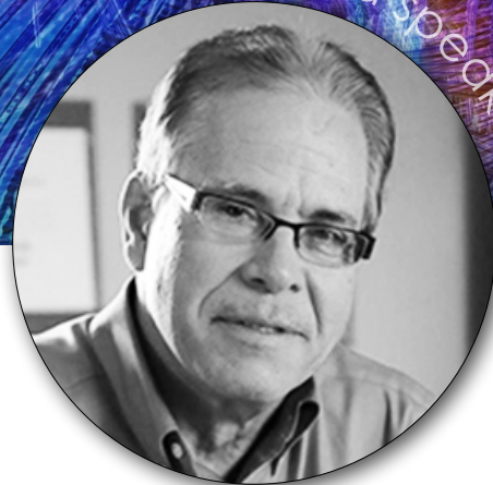
SEN. MIKE BRAUN (R-IN) U.S. Senate

The November elections will reset the table for labor and employment legislation. On November 16, Sen. Mike Braun (R-IN) and Rep. Virginia Foxx (R-NC) will join us to discuss the implications of the midterms, including the prospective legislative developments in the 118th Congress. Following this discussion, HR Policy staff will lead a conversation on what the results mean for large employers.